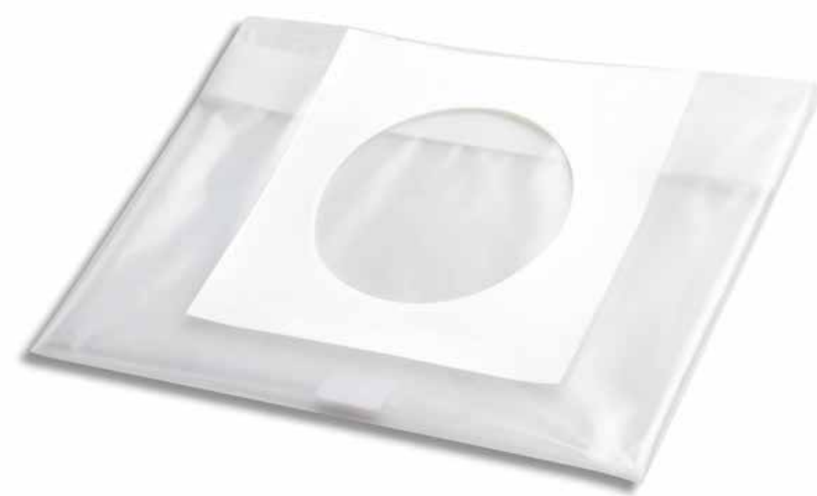
Adhesive Surgical Drape for the Operation Area