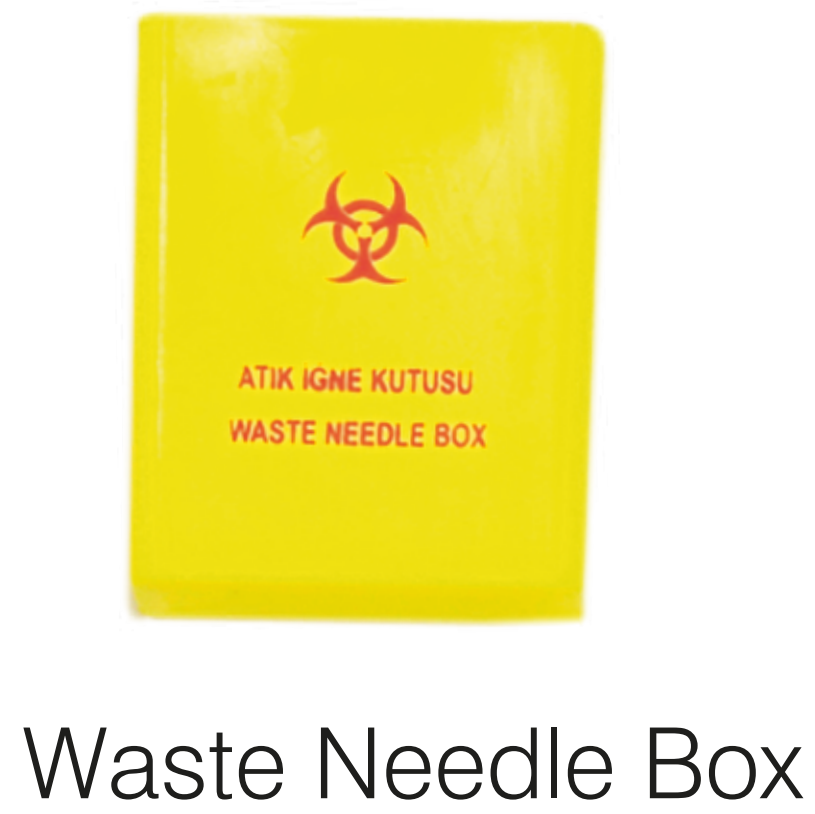
Waste Needle Box